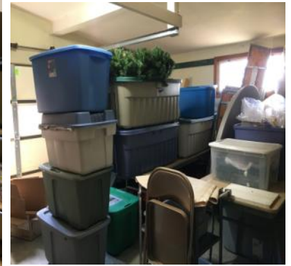
(Storage Room 2) Before ↑