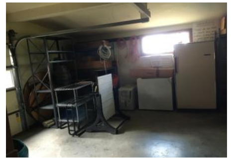
(Storage Room 2) After ↓