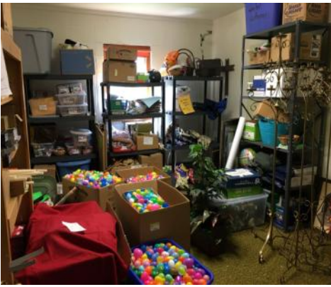
(Storage Room 1) Before